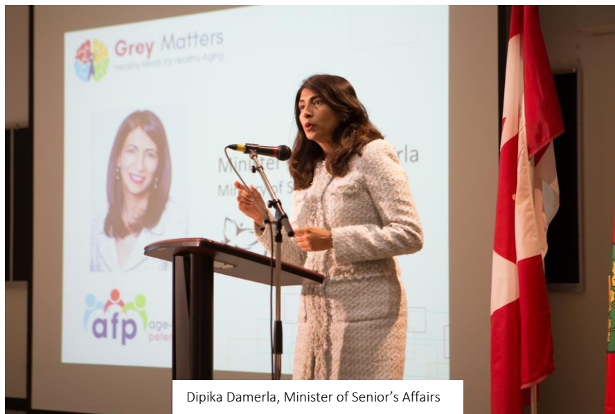
Dipika Damerla, Minister of Senior's Affairs

Organized by Age Friendly Peterborough and hosted by TCAS, this year's summit, titled Grey Matters: Healthy Minds for Healthy Aging , attracted more than 200 people to discuss the connection between mental well-being and healthful aging.