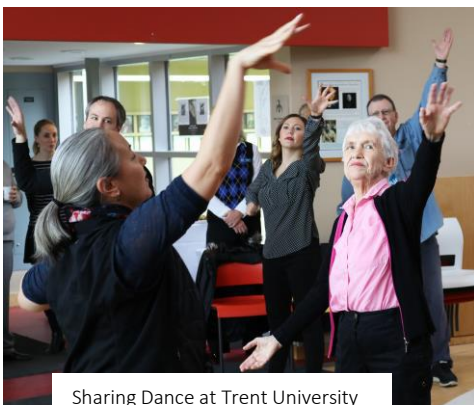
Sharing Dance at Trent University