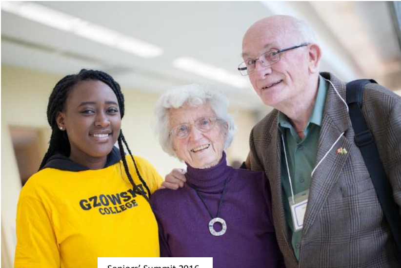
Seniors' Summit 2016